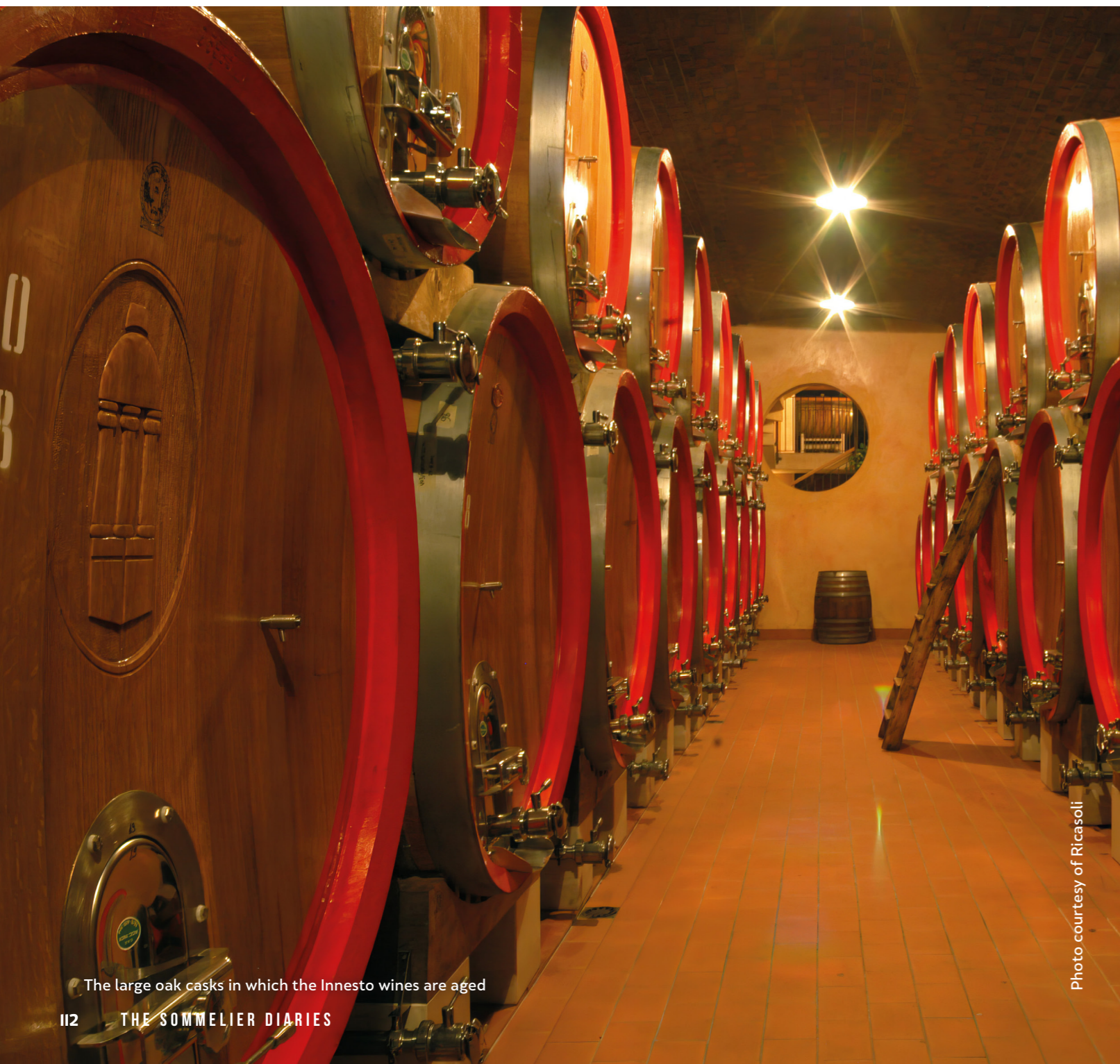
The large oak casks in which the Innesto wines are aged