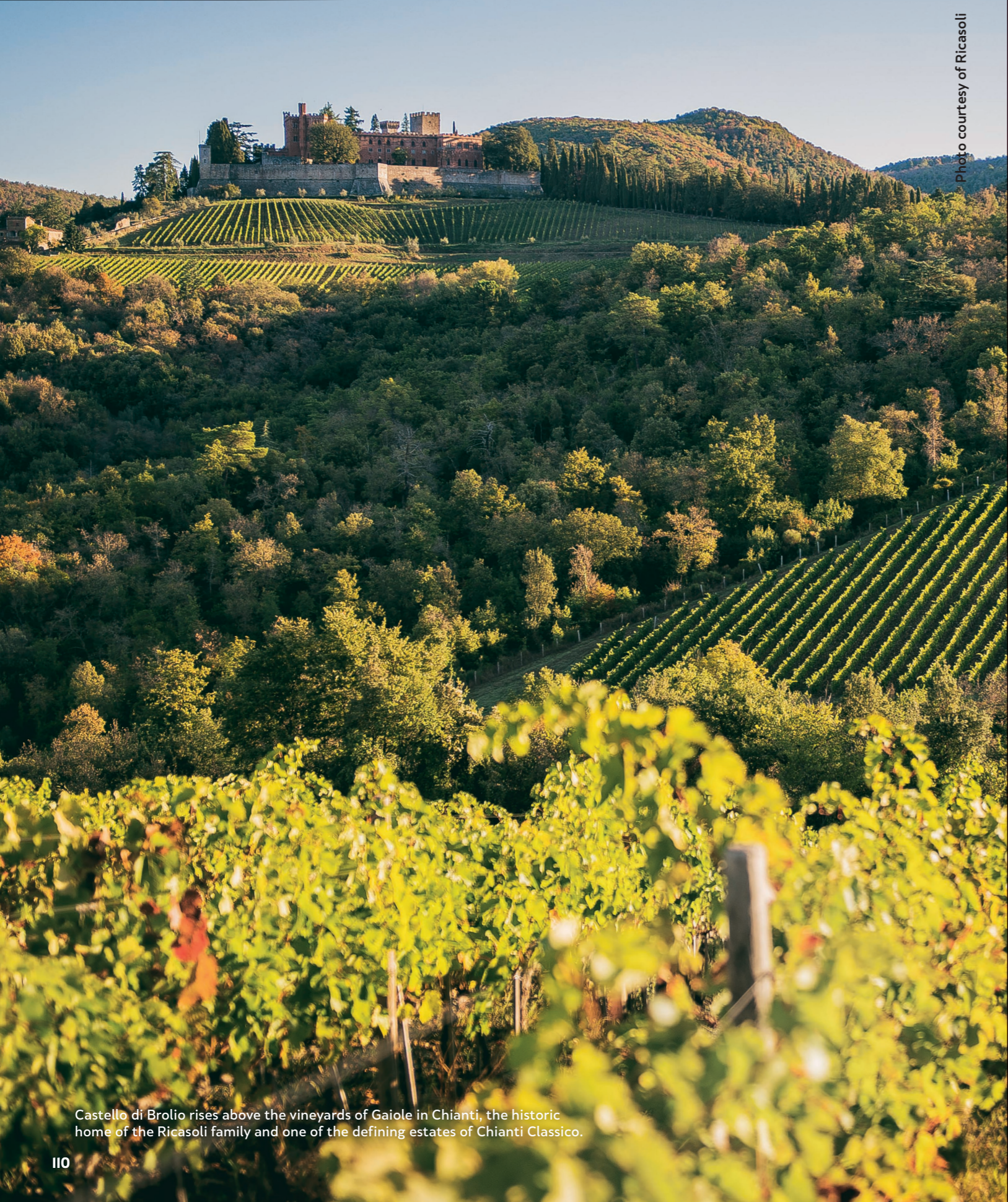
Castello di Brolio rises above the vineyards of Gaiole in Chianti, the historic home of the Ricasoli family and one of the defining estates of Chianti Classico.