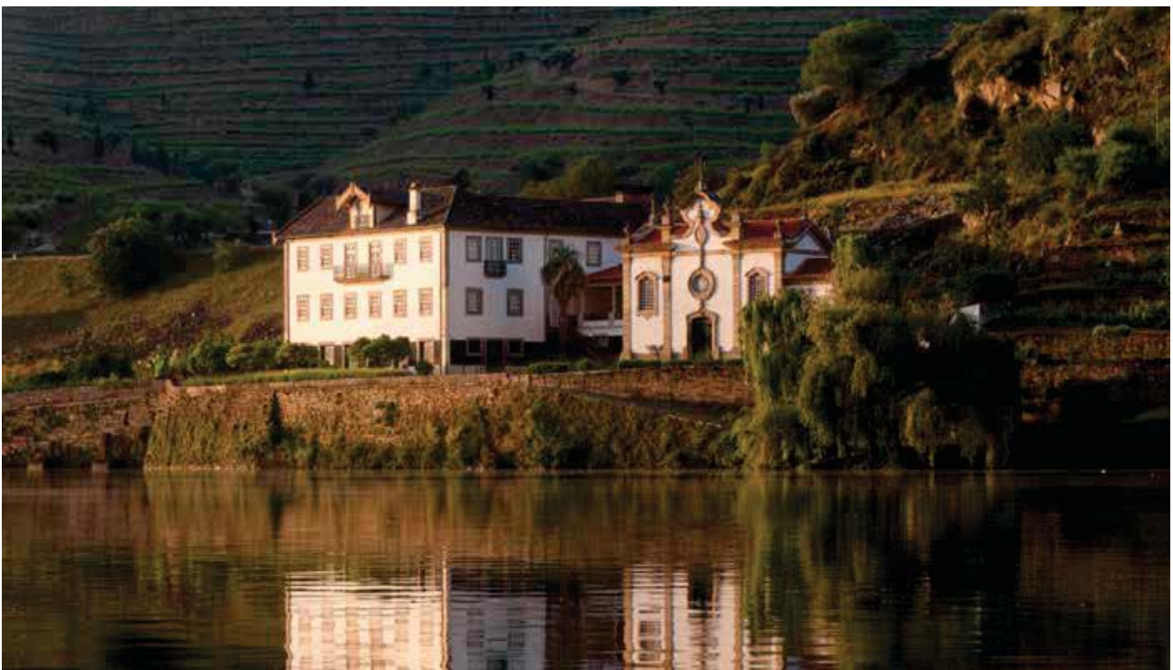
IMAGES This page – Above – Vineyards at Quinta do Vesuvio in the Douro Superior. Bottles – Quinta do Vesuvio Douro DOC, Pombal do Vesuvio Douro DOC, Quinta do Vesuvio Vintage Port.

The Quinta's special reputation for producing outstanding wines dates back to the 19th Century