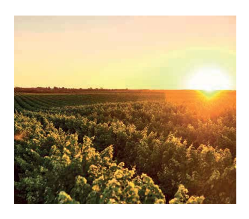
Hill-Smith Family Vineyards seek to craft wines that reflect a thoughtful interpretation of grape, terroir and style

Since then, the Hill-Smith family have continued to invest in vineyard sites across Australia. Some are iconic sites in established regions, such as the Pewsey Vale Vineyard in the Eden Valley in South Australia, whilst others are investments in emerging new regions, like the Dalrymple Vineyard in Tasmania. All of these properties have benefitted from knowledge and experience garnered over previous vintages, together with the introduction of new varieties from the Yalumba Nursery.