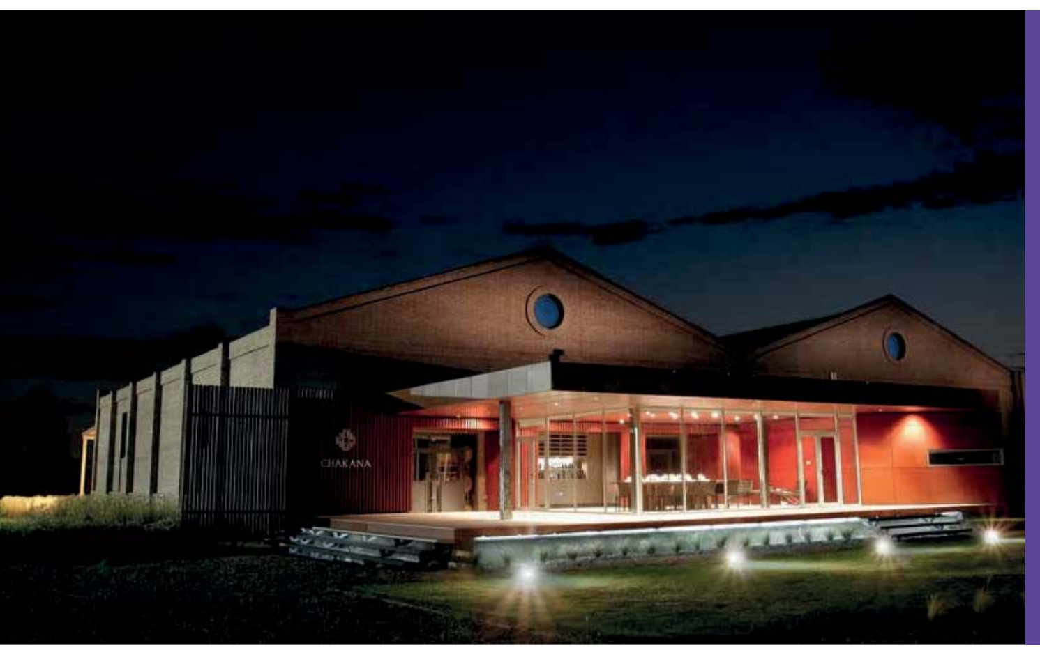
IMAGES Above – Chakana winery. Bottles – Chakana Nuna Estate, Chakana Estate Selection and Ayni, the Estate's iconic Malbec from Altamire.

Chakana Range – young fruit driven wines aged briefly in oak. This range includes Torrontés, Malbec Rose, and Malbec.